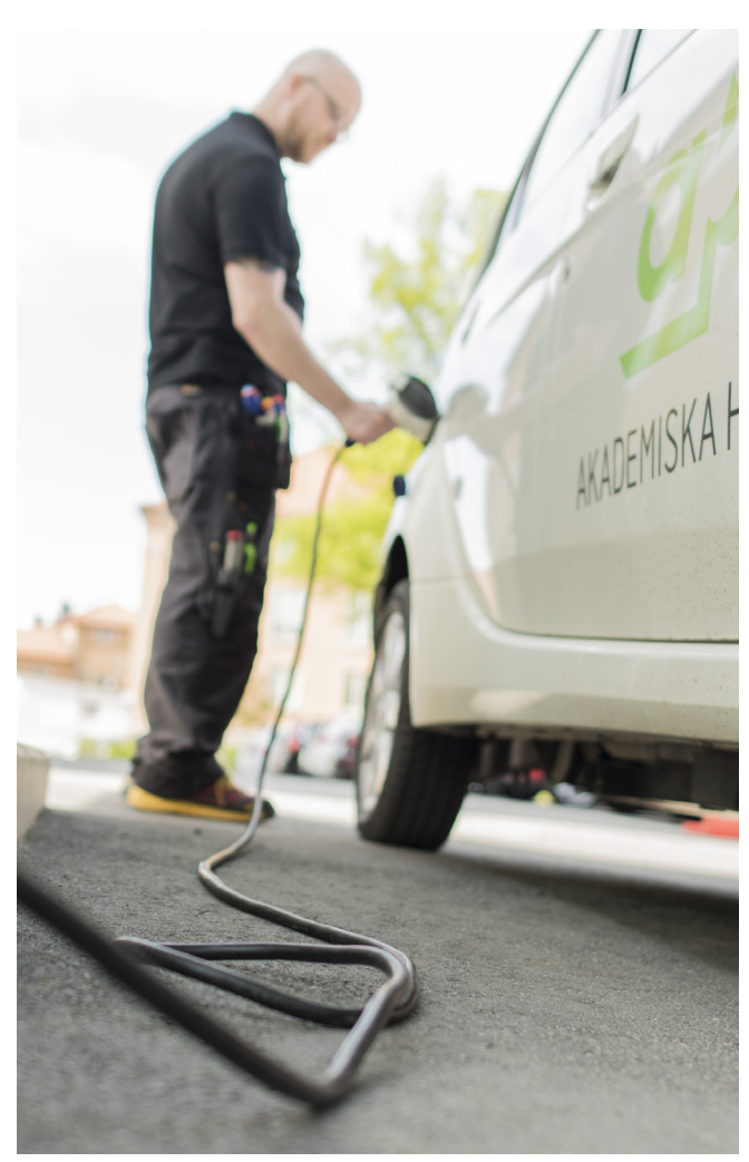
Charging stations on campus.