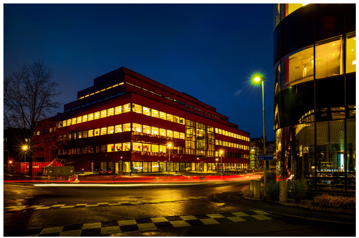
A Working Lab, Gothenburg.