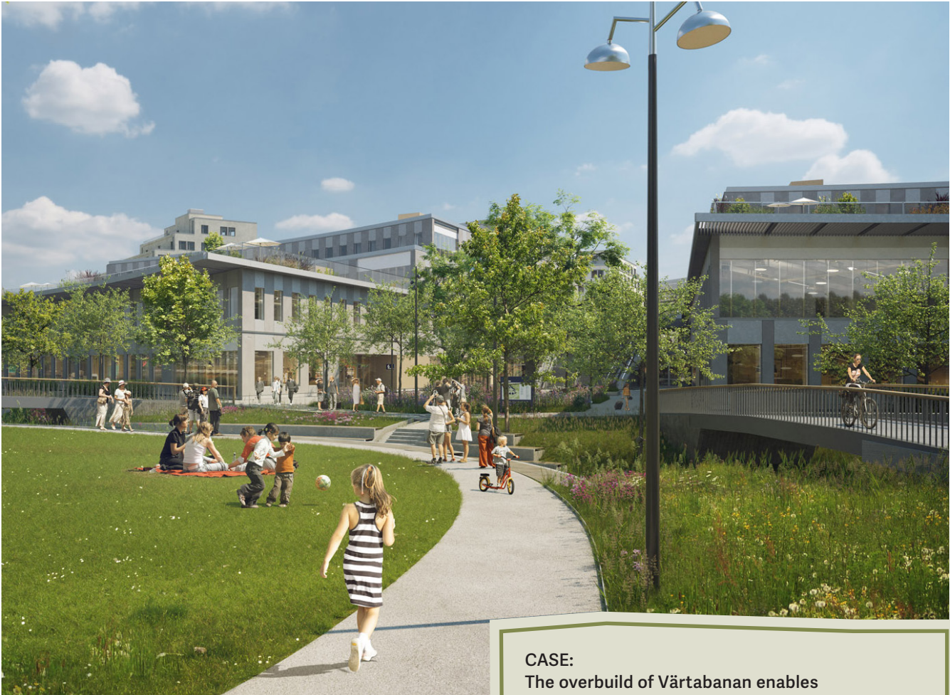
Albano, Stockholm, BSK Arkitekter,