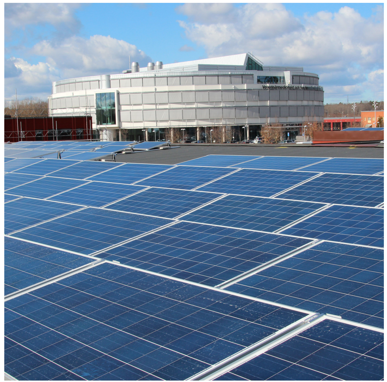
Solar panels at Ultuna Campus.