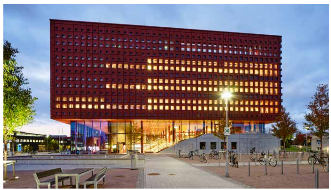
Studenthus Valla, Linköping.